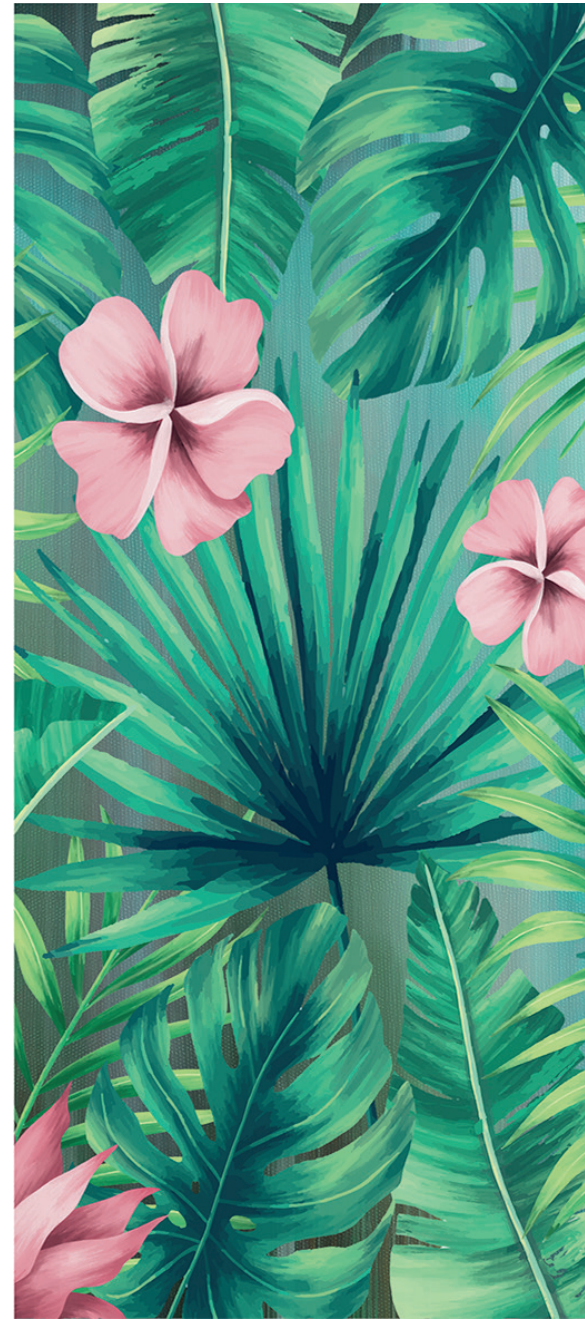
2 120x278cm /47.25"x109.5"