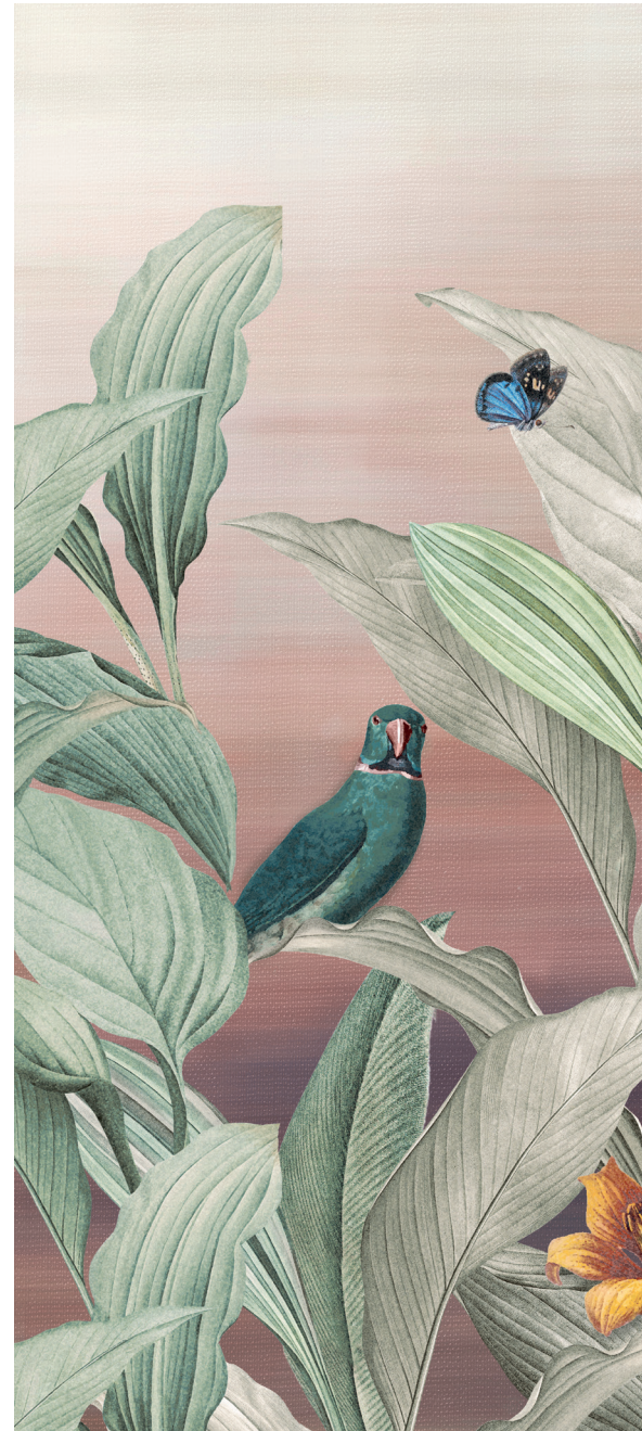
2 120x278cm /47.25"x109.5"