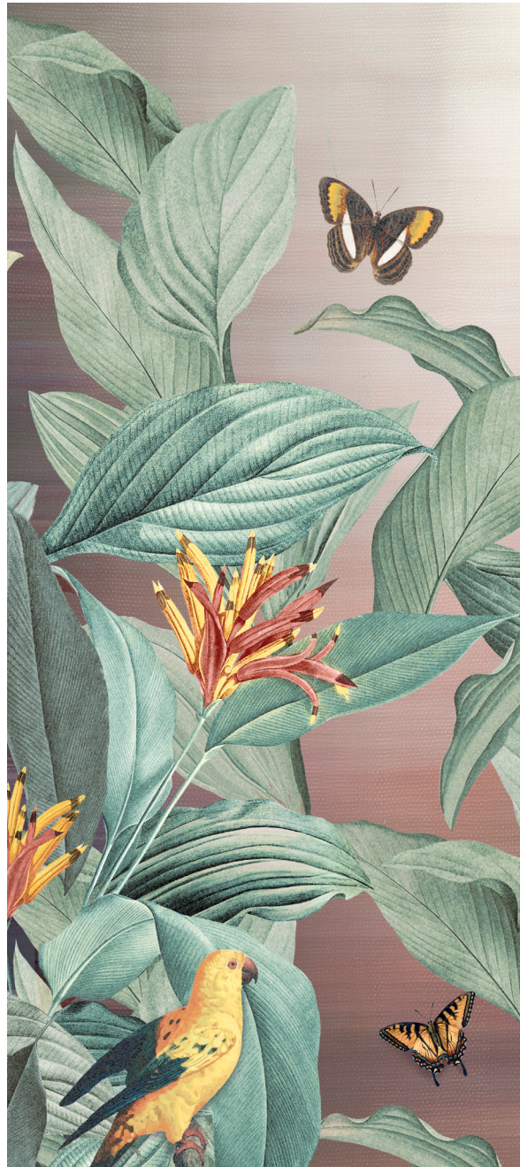
1 120x278cm /47.25"x109.5"