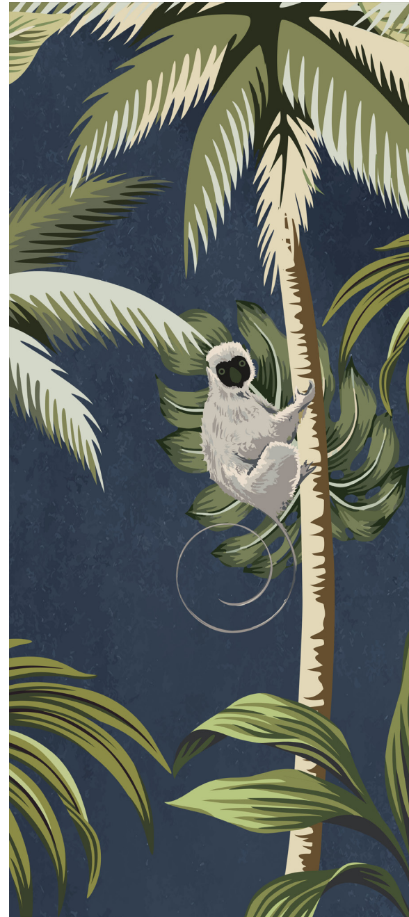
2 120x278cm / 47.25"x109.5"