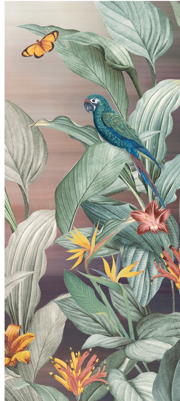
3 120x278cm /47.25"x109.5"