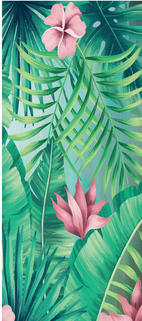
1 120x278cm /47.25"x109.5"