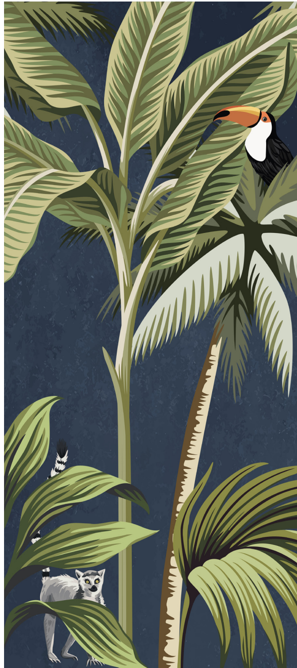
1 120x278cm / 47.25"x109.5"