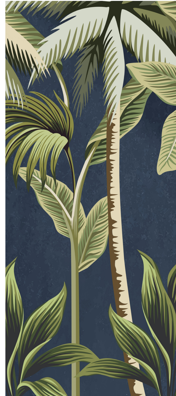
3 120x278cm / 47.25"x109.5"